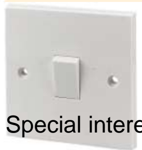
Special interest tool